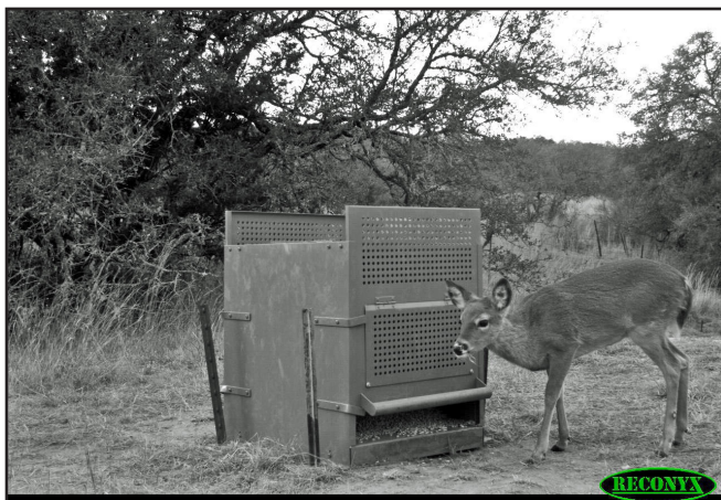
Figure 2. The HogHopper™ developed by the Invasive Animals Cooperative Research Centre in Australia and Animal Control Technologies Australia.

use the BOST™. During the second trial, investigators found that bait removal from the BOST™ was reduced by only 10% for feral swine when activated, whereas bait removal from the BOST™ by all other wildlife was reduced by 100% when activated (Campbell et al. 2011). Furthermore, 90% of the feral swine population had consumed baits delivered through the BOST™ and would have received a dose of the biologic, compared to only 13% of the raccoon population (Campbell et al. 2011).