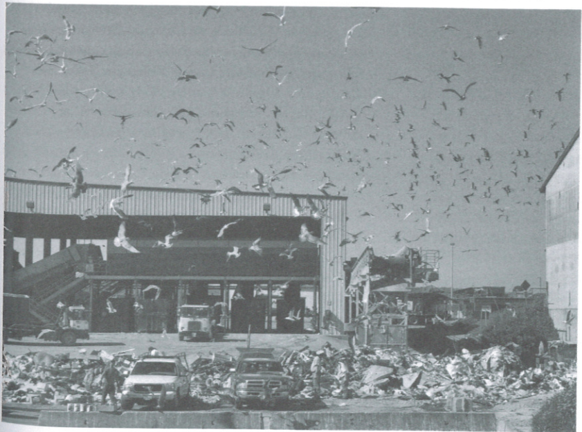
Fig. 8.4. When not managed properly, solid waste management facilities like this trash-transfer station can attract wildlife hazardous to aviation.