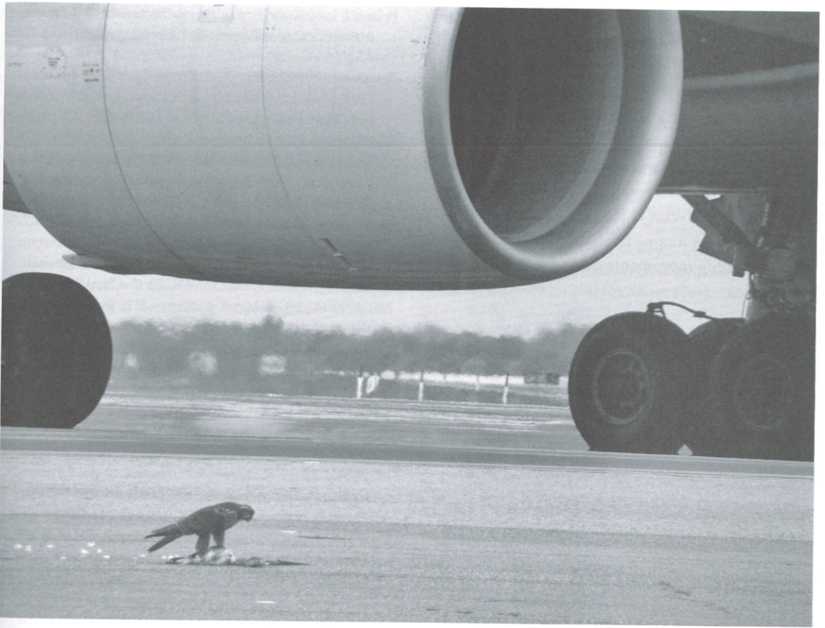
Fig. 8.3. A peregrine falcon ( Falco peregrinus ) feeds on a gull carcass at a major airport in the eastern USA. Animal carcasses found on airfields should be removed immediately upon discovery so they do not attract hazardous wildlife.