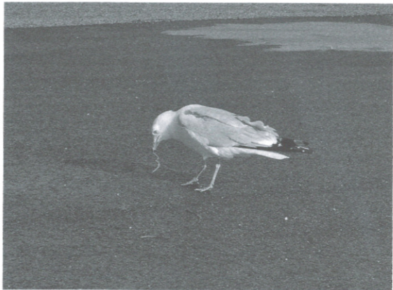
Fig. 8.2. A ring-billed gull ( Larus delawarensis ) feeds on earthworms on an active aircraft taxiway. Direct observation of wildlife foraging in airport environments can identify important food resources.

observed directly, and the use of dietary samples can be bypassed entirely (Table 8.1; Fig. 8.2). Direct observation is inexpensive and minimally invasive, and at times sex and age classes can be determined. But data from direct observations are generally biased toward large and conspicuous prey (small prey items are often missed entirely), and observations are usually limited to open environments. In addition, if the focal individual presents an immediate risk of collision with an aircraft, dispersal or removal obviously takes precedence over observation. Apparent feeding sites also can be investigated to determine the species responsible for food consumption and the amount of food consumed. This technique is limited to certain circumstances (e.g., foraging on agricultural crops; MacGowan et al. 2006) and is usually applicable only to herbivores. When conducting direct observations or feeding site surveys, it is still important to consider food availability in relation to foods consumed.