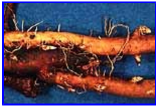
Figure 2. Buds on hemp dogbane root system.

buds on its root system ( Figure 2 ). The root system is extensive, often penetrating 5 to 10 feet into the soil. Like the milkweed family, all parts of the plant contain a white, milky sap.