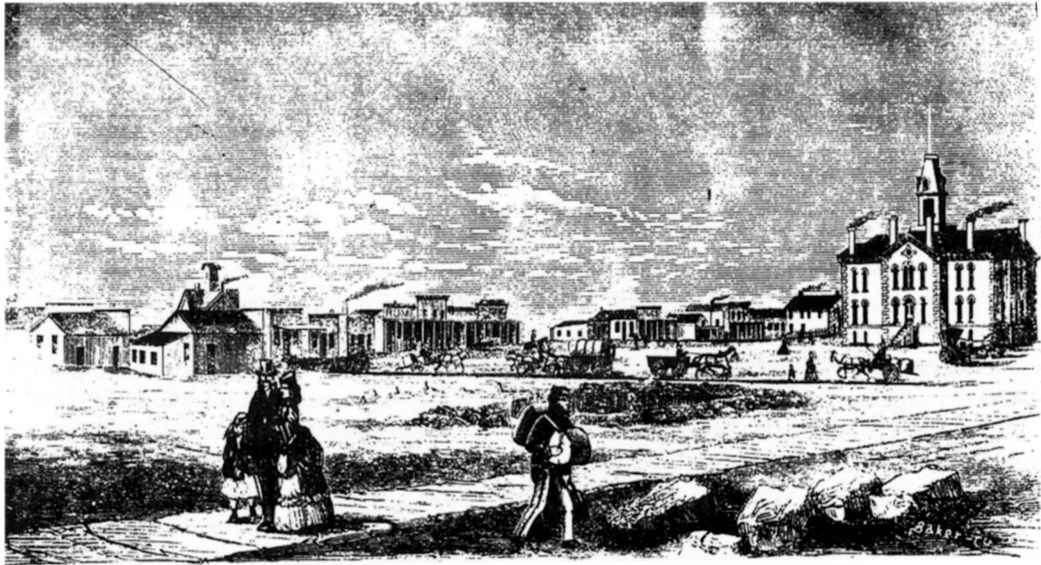
GREAT BEND CITY—CATTLE DEPOT ON THE A. T. & ST. FE R. R.