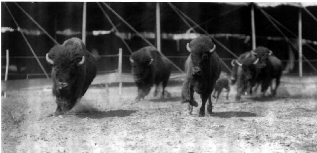
FIG. 1. Buffalo Bill's Wild West exposed millions of North Americans and Europeans to live buffalo, offering an opportunity to watch them in action. Seeing a display of mounted animals at a museum, or one or two in a small enclosure at a zoo, was one thing; watching them run at full gallop was quite another. Courtesy of Denver Public Library, Western History Collection, Nate Salsbury Collection (call number X 22275).

Railroad construction crews. 4 Some would argue this was not such a transgression. He did not kill solely for sport or for the hide and then wastefully leave the carcass to rot; rather, he supplied sustenance for the laborers of progress. In Cody's last interview, Chauncey Thomas portrays him as considering it "not . . . so much hunting as it was railroad building, opening the wilderness to civilization. . . . [T]he buffalo had to go as the first step in subduing the Indian." In the same article Thomas states that "the elimination of the buffalo was not wanton; it was necessary." 5 In an earlier article written by Buffalo Bill, he suggests that there were, as of 1897, not enough buffalo left to repopulate the Plains "even if it were desirable to restore them." 6 Based on these admittedly select quotes, one would be hard pressed to make a case for Cody as a friend of the buffalo, much less any sort of preservationist.