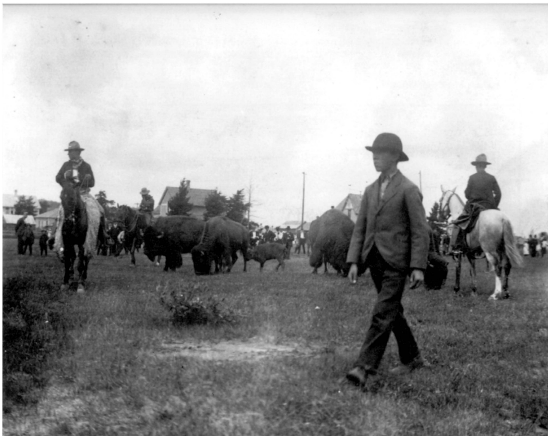
FIG. 5. The show's herd had an impact far beyond the staged performances. Even mundane events like grazing outside the show grounds could draw a crowd. Courtesy of Denver Public Library, Western History Collection, Nate Salsbury Collection (call number NS 647).