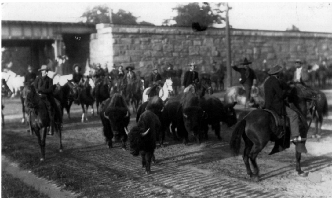
FIG. 2. Moving the show's herd was never taken lightly; it appears that six riders were assigned to move five buffalo in this 1901 photograph. Courtesy of Denver Public Library, Western History Collection, Nate Salsbury Collection (call number NS 253).

withdrew from the museum business in Niagara Falls. 26 If these shows established a framework for Cody to follow, they also demonstrated that performing buffalo hunts was risky business.