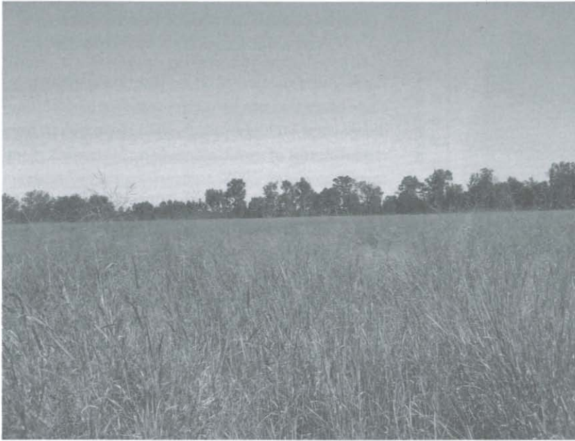
Fig. 11.3. Switchgrass ( Panicum virgatum ) field planted for biomass production near West Point, Mississippi, USA.

Fig. 11.3). But many of these studies were conducted on Conservation Reserve Program fields, which limit applicability to biofuel production at airports. Recent studies examining impacts of cellulosic biofuel crops on wildlife indicate that both Miscanthus and native grasses, including switchgrass and native warm-season grasses (as mentioned earlier), may provide benefits to some birds during winter and breeding seasons (Murray et al. 2003, Bellamy et al. 2009, Sage et al. 2010). The benefits of Miscanthus are temporary, however, without continuous wildlife management practices necessary to maintain the features of established plots that are attractive to birds (Bellamy et al. 2009). These features may be lost if plots are managed primarily to maximize biofuel production (Bellamy et al. 2009). There are additional questions regarding wildlife response to large plots of Miscanthus in the USA, as the vegetation structure is different from native grasslands, and it is unknown if avian species would perceive the bamboo-like vegetation as suitable habitat (Fargione et al. 2009).