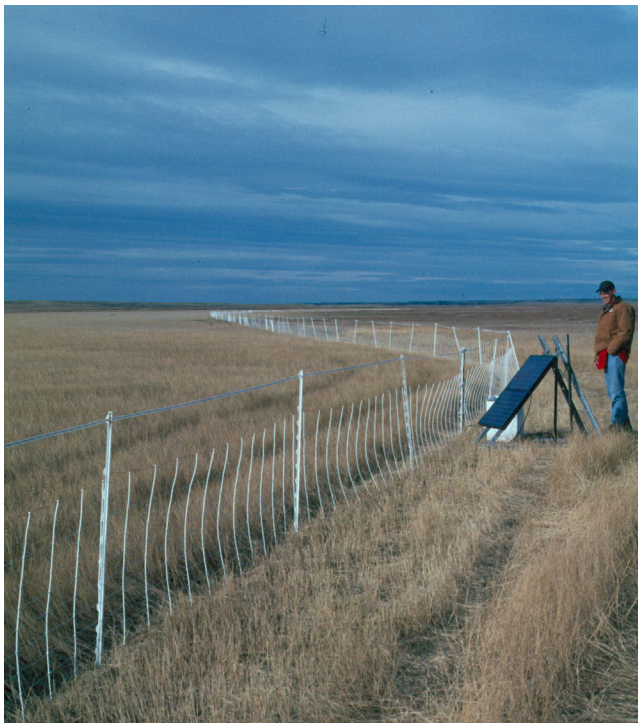
Figure 1. Electric fencing (ElectroNet™ Premier1 Supplies, Washington, IA) used to exclude coyotes from portions of black-tailed prairie dog colonies in an attempt to increase survival of black-footed ferret kits during 2010 on the UL Bend National Wildlife Refuge in Montana, USA.

Thus, another recovery strategy to rearing ferrets in captivity is to “harvest” wild-born kits from sites with large and stable ferret populations for translocation elsewhere.