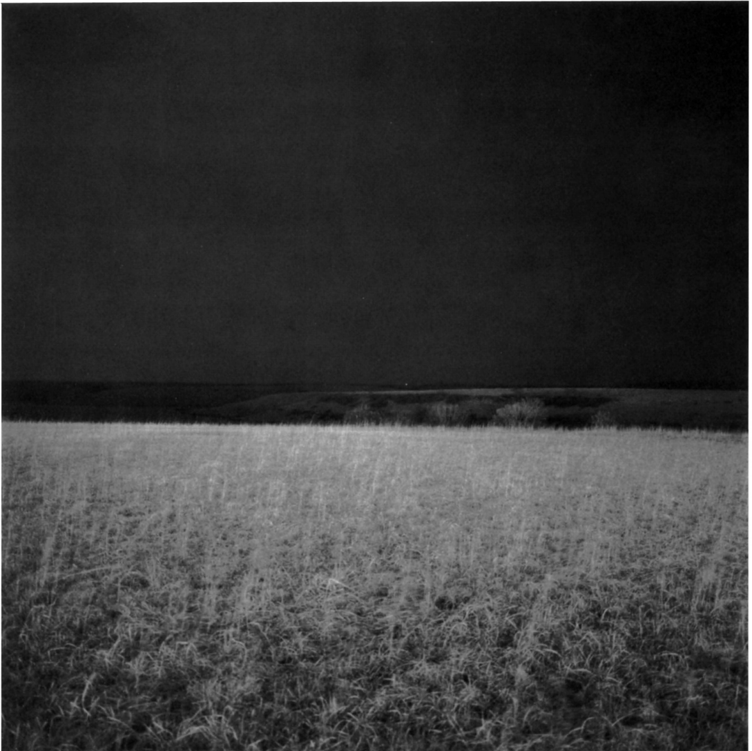
FIG. 6. Larry Schwarm, Light from the fire near Chase County Lake, Kansas , 2000. Color photograph, 29 × 29 inches. Permission of the artist.

differential between the two photographs. Static but also mystical, two winter scenes, Jacobshagen's Snow Field (2003) and Schwarm's Snow, Greenburg, Kansas (1989), present nearly equal blocks of whiteness with the horizon permitting a subtle shift in the pastel colorations in the white earth and sky.