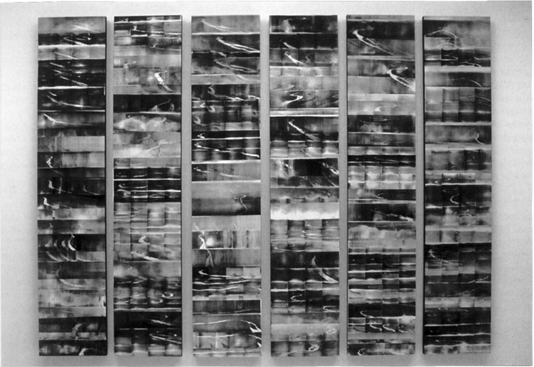
FIG. 12. Lisa Grossman, 86 Bends of the Kaw , 2004. Relief roll woodcut on silk tissue, mulberry paper, six wood panels, each 80 × 16 inches. Museum purchase made possible through Peter T. Bohan Art Acquisition Fund and an anonymous gift. Spencer Museum of Art, Lawrence, Kansas. Permission of the artist.

of these astonishing environments. They do so diversely, whether evoking wonder or nostalgia for the light of open spaces, whether using realistic or abstract modes of interpretation. They do so even as these environments are changing and receding before expanding populations, increased pollution, and aggressive exploitation of resources, reminding us to cherish both sea and prairie before we have only a screen-saver of a sea of grass to show us our loss.