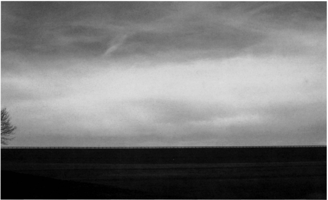
FIG. 9. Peter Thompson, Clinton Dam, 2003. Archival print, 9 × 14 1/2 inches. Collection of the artist.

her surfaces deceive the viewer, who mistakes the backs of cows, their hairs simulating grass, their musculature undulating land, for rumpled prairies and scruffy slopes. In her series of Cowscapes , she “merges common Midwest symbols to create a vast new world that reflects the natural prairie of my home,” intending through her work to elevate “a lowly, domestic animal bred and raised mainly for consumption” to “the level of sublime landscapes by being pushed into the high art setting of a vibrant, detailed photograph.” 30