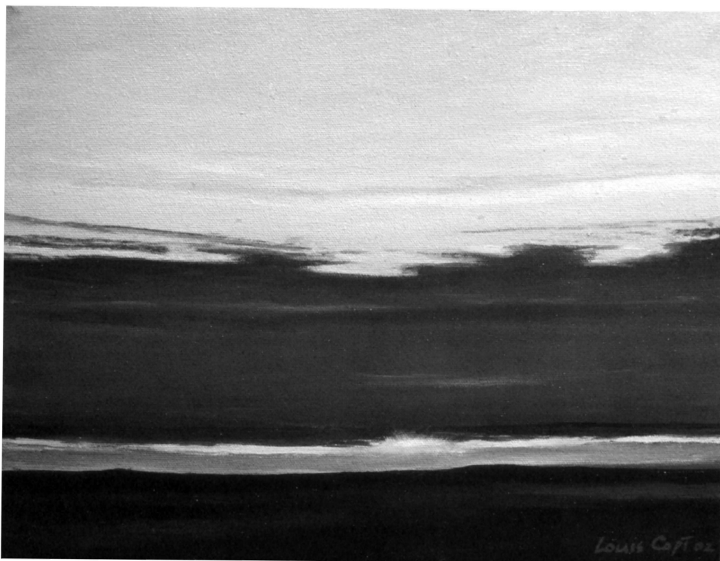
FIG. 4. Louis Copt, Flint Hills Sunrise , 2002. Oil on canvas, 11 × 14 inches. Private collection.

not an abstraction,” emphasizes the permeability of abstraction and realism in the creation of modern seascapes. 26 The generic titles of Avery’s paintings, such as The White Wave (1956) and Tangerine Moon and Wine Dark Sea (1959), and of Marin’s, such as Sea, Dark Green and Yellow (1921) and The Written Sea (1952), indicate their removal from cartographic reference.