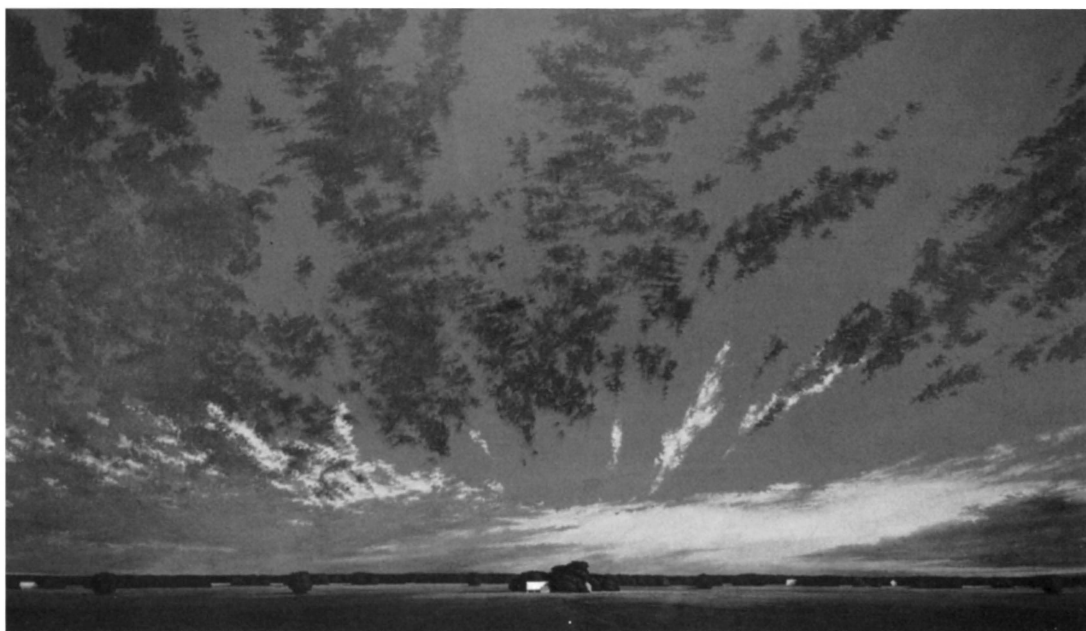
FIG. 2. Keith Jacobshagen, Crow Call (Near the River) , 1990-91. Oil on canvas, 46\frac{3}{16} \times 80\frac{1}{8} inches ( 117.32 \times 203.52 cm.). The Nelson-Atkins Museum of Art, Kansas City, Missouri. Museum purchase made possible through the generosity of the National Endowment for the Arts and the Nelson Gallery Foundation, F91-12.

of The Sublime , which acknowledged “the unmediated power of Deity in the universe, emphasizing obscurity, indefiniteness, the immeasurable, the uncontained and uncontrolled” (Stein, 18). 24 In contemporary prairie-escapes, it is the illusion of endless empty space in sky and land and the diffusion of light in this space that replace evocations of divinity.