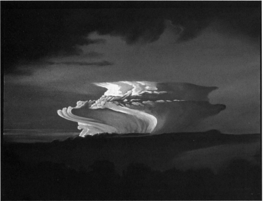
FIG. 7. Louis Copt, Vulcan's Anvil , 2002. Oil on canvas, 30 × 40 inches. Collection of the artist.

sky merge, obfuscating the horizon altogether, as in Grossman's lithograph Prairie Night (2002).