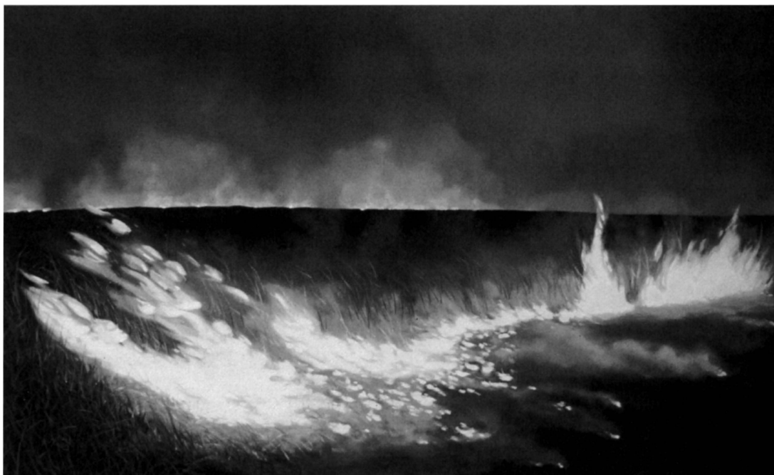
FIG. 10. Louis Copt, Prairie Nightfire , 2004. Oil on canvas, 18 × 24 inches. Private collection.

Fire on Highland Ranch, Chase County, Kansas (1996). Copt sets the entire sky on fire in Prairie Nightfire (2004) (Fig. 10) and Burning in the Night (2004), or as smoke moves up into the sky in Sunset Flames with Full Moonrise (2004), he displays striations of deep color—crimsons, violets, ultramarine. Schwarm's final photograph in On Fire, New grass about two weeks after burning, Chase County, Kansas (1996) (Fig. 11), is placed following his own and Adams's statements. As if beyond comment, this photograph shows the natural miracle of a restored prairie, densely green with its deeply shadowed troughs, filling space as it reaches like an inland sea to the sky.