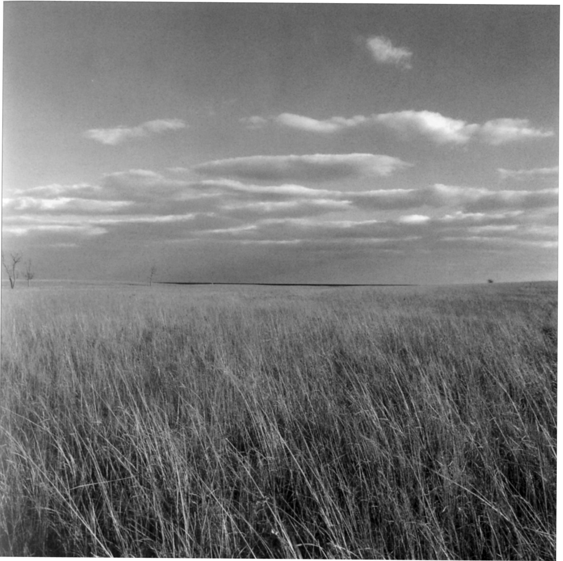
FIG. 5. Larry Schwarm, Grass and burned field , Lyon County, Kansas, 1991. Color photograph, 29 × 29 inches.

what I'm looking at, my point of reference is the minimalist landscape of Kansas where I first observed the world." 27 Like contemporary maritime artists, Kansas artists—both painters and photographers—have been inspired by the prairie's ostensibly minimalist landscape to recreate the earth and sky in Rothko-like blocks, relying on the horizon to establish contrasts in light, color, and texture. In their works, earth and sky may share the picture equally,