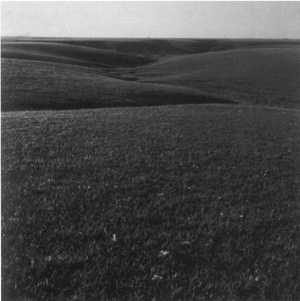
FIG. 11. Larry Schwarm, New grass about two weeks after burning, Chase County, Kansas, 1996. Color photograph, 29 × 29 inches. Permission of the artist.

tangles that draw the viewer into mysterious convolutions. Resembling the abstract representations of the sea in the intricate coilings of a Pollock marine painting or the minutiae of a Clemins's drawing of waves, Evans's close-up photographs of grasses and flowers tangled together also accurately reflect precise botanical species. However, even as she focuses her lens on the prairie's surface, Evans sees a relationship between its finite plants and infinite spaces: