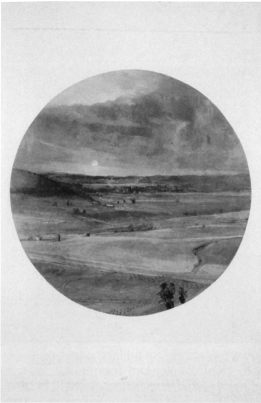
FIG. 8. Robert Sudlow, Valley Sundown , 1984. Oil on canvas, 44 inches diameter. Private collection.

sea in terms of water and sky and the prairie in terms of earth and sky with the horizon separating these elements—coincides with a national nostalgia for open space and has resulted in the iconization of the images of sea and prairie. Their proliferation for sale not only in galleries but also in catalogues and museum shops suggests their commercial popularity in several markets. It is not surprising that these aesthetics have resulted in parodies of both sea and prairiescapes by quite well-known but disparate national and Kansas artists, in which land and sea, earth and sky, are simply divided by a straight line on a flat canvas. Roy Lichtenstein's comic Seascape (1964) is a sandwich of flat stripes—between a stiff black band and a stiff red band are undulating bands of grey, yellow, yellow dotted with