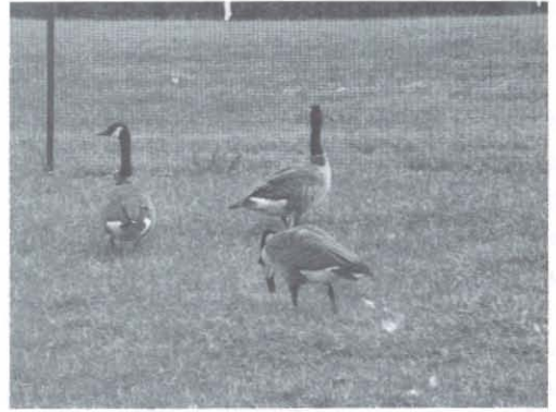
Fig. 10.3. Canada geese in study plot. Research examining the foraging preferences of Canada geese provides information about the selection of plant materials for reseeding projects at airports.

Grazing Anatidae (including various species of geese) apparently make foraging choices based on the nutritional content and chemical composition of plants (Gauthier and Bedard 1991, McKay et al. 2001, Durant et al. 2004). The concentration of protein within forage plants is an important component in the foraging preferences for a variety of goose species, including barnacle geese ( B. leucopsis ; Prins and Ydenberg 1985), dark-bellied brent geese ( B. bernicla bernicla ; McKay et al. 2001), white-fronted geese ( Anser albifrons albifrons ; Owen 1976), graylag geese ( A. anser ; Van Liere et al. 2009), and Canada geese (Sedinger and Raveling 1984, Washburn and Seamans 2012). In addition, sec-