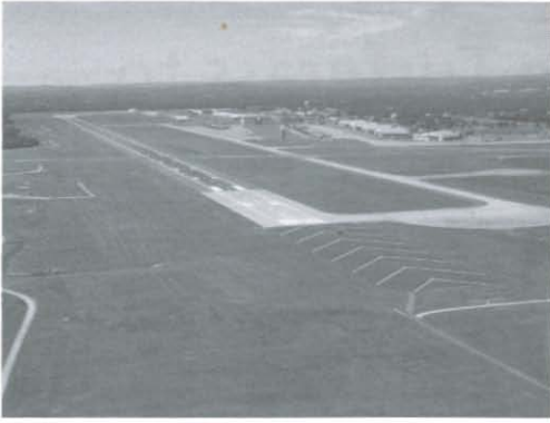
Fig. 10.1. Westover Air Reserve Base, Chicopee, Massachusetts, USA. Airfields often contain large expanses of vegetation, typically composed of turfgrasses and herbaceous vegetation.

ing cover for hazardous wildlife (DeVault et al. 2011), and resist invasion by other plants that provide food and cover for wildlife (Austin-Smith and Lewis 1969, Washburn and Seamans 2004, Linnell et al. 2009; Fig. 10.1).