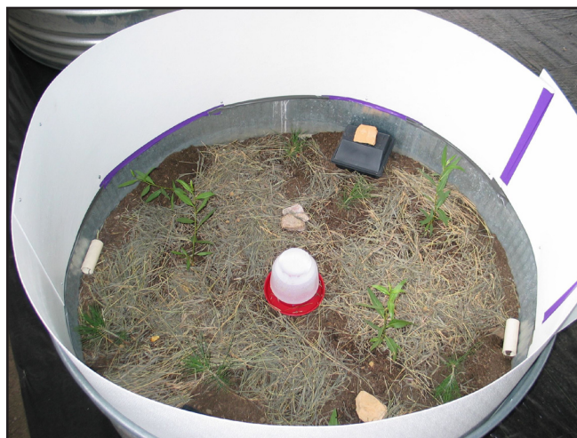
Figure 1. The stock tank set-up for the seedling damage trials.

We planted and monitored seedlings of a coniferous species, ponderosa pine ( Pinus ponderosa ), and a deciduous species, narrow-leaf cottonwood ( Populus angustifolia ) in 8 metal stock tanks containing about 7 inches of topsoil and occupied by 4 deer mice or 4 house mice, to assess the potential for damage by these rodents (Figure 1). One male and 3 female mice were used in each