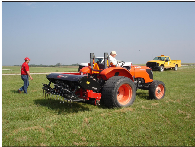
Figure 1. The Toro Deep Tine soil compactor and aerator. Note the long tines.