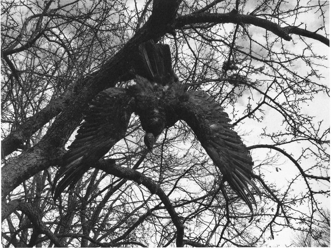
Fig. 2.2. Taxidermy mount of a turkey vulture suspended as an effigy to deter roosting by conspecifics.

brown-headed cowbirds ( Molothrus ater ) and mourning doves ( Zenaidura macroura ), as well as properties of the visual system for both species. The authors found that vehicle lighting (i.e., the visual cue) can influence the avoidance behavior by cowbirds and that reaction to vehicle approach and light treatments was also affected by ambient light. Avoidance behavior by doves was not affected by lighting treatments, but doves became alert more quickly (on average by 3.3 s) than cowbirds. In contrast, cowbirds took flight sooner than doves. The authors also found that doves have a wider field of vision and can detect objects at a greater distance due to their higher visual acuity; however, cowbirds might flush earlier to reduce predation-risk costs associated with lower ability to visually track a given object. In extending their findings to reducing bird collisions with aircraft, Blackwell et al. (2009) suggested that there is potential to design vehicle-mounted