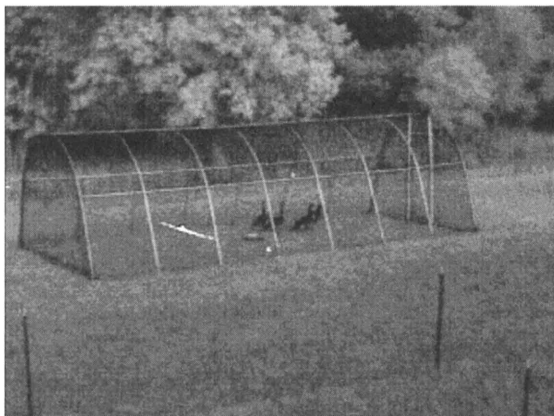
Fig. 2.1. Captive Canada geese moving perpendicular to (away from) a laser beam from a moderate-power (i.e., 5–500 mW), 650-nm laser in experiments conducted by Blackwell et al. (2002). Laser power specifications from U.S. Department of Labor, Occupational Health and Safety Administration; see http://www.osha.gov/dts/osta/otm/otm_iii/otm_iii_6.html .

(e.g., captive versus free-ranging birds, light conditions surrounding a roost that can affect dark adaption by retinal photopigment and subsequent sensitivity to laser beams and beam spots, or predation risk outside a roost) likely affect potential responses to laser treatment. Sherman and Barras (2004) found that Canada goose response to a 650-nm laser was limited by ambient lighting and pond size. Similarly, Gorenzel et al. (2002) found that American crows occupying urban roosts responded to moderate-power, 630- and 650-nm lasers, but quickly reoccupied roosts. In an evaluation of moderate-power, 473- and 534-nm lasers against white-tailed deer, VerCauteren et al. (2006) noted that deer detected laser treatments, but the devices were ineffective as dispersal tools. In reference to findings by Blackwell et al. (2002) relative to birds, the authors noted that differential effectiveness of lasers may be due to species-specific differences in threat perception and avoidance behavior.