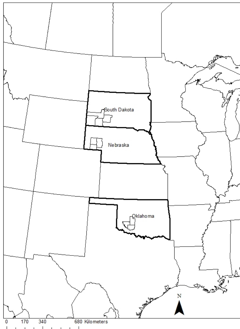
Figure 1. Locations of counties for estimates of home range for bighorn sheep ( Ovis canadensis ), elk ( Cervus elaphus ), mule deer ( Odocoileus hemionus ), and white-tailed deer ( O. virginianus ) in three study areas in the Great Plains, 2002–2006.

We conducted our study on Rocky Mountain elk within the Wichita Mountains Wildlife Refuge (WMWR) in southwestern Oklahoma, that encompassed Caddo, Comanche, and Kiowa Counties and private lands north of WMWR (Fig. 1; Walter et al. 2005). Igneous mountain peaks with slopes >25^\circ (Hoffman 1930) typified the northern part of WMWR and extended northward into private land, referred to as the Granite Area, with 25% forest cover in a mosaic of native warm sea-