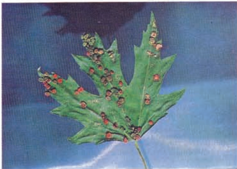
2. Maple bladder gall