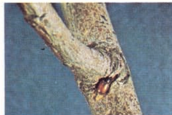
7. Smaller European elm bark beetle and galleries