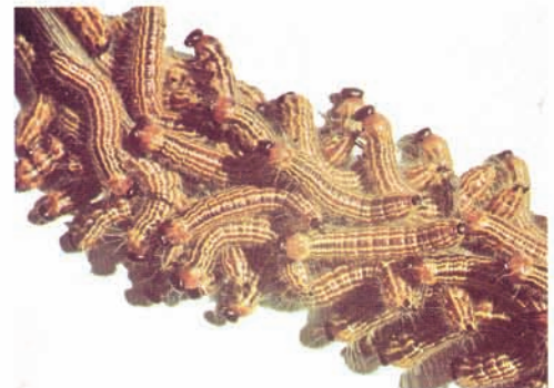
10. Yellow-necked caterpillar