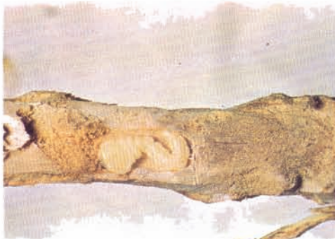
3. Flatheaded borer