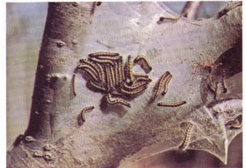
9. Eastern tent caterpillar