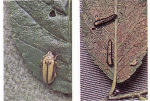
8. Elm leaf beetle and larvae