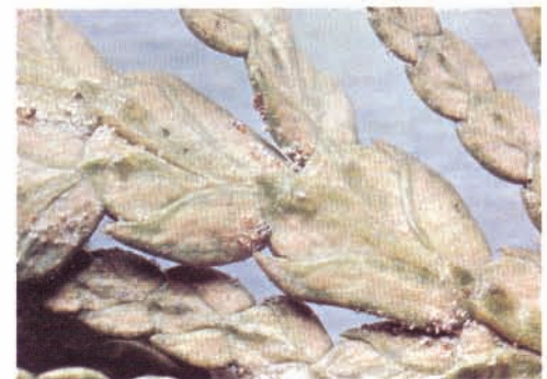
11. Spruce mite injury