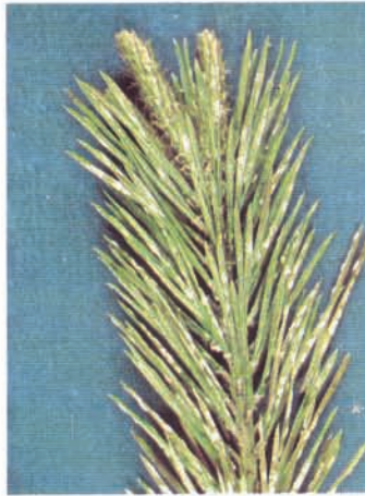
5. Pine needle scale