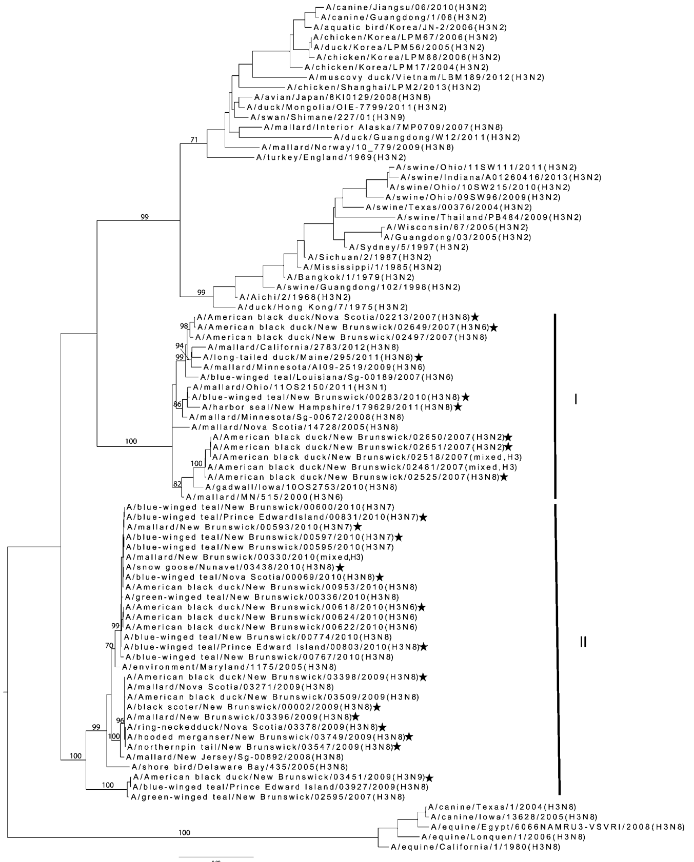
Fig. 1. Phylogenetic analysis of HA genes of H3 IAV isolates from migratory waterfowl in North America (2007–2011). The H3 IAV isolates included in antigenic characterization are marked with a star. The phylogenetic analyses were performed using maximum likelihood by the GARLI version (5), and bootstrap resampling analyses were conducted using PAUP* 4.0 Beta (52) with a neighbor-joining method, as previously described (6).