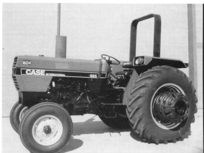
Case International 685 Diesel