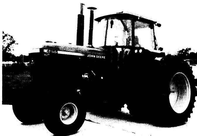
John Deere 4255 Quadrange Diesel