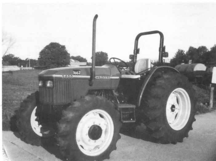
John Deere 5400 Diesel