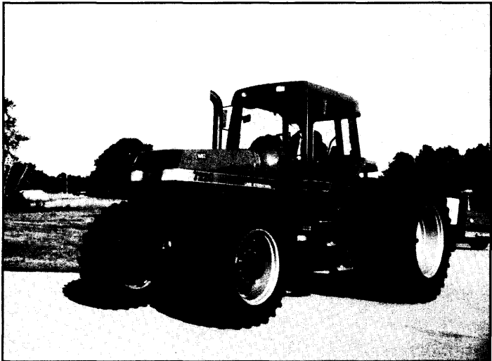
CASE INTERNATIONAL 7220 DIESEL