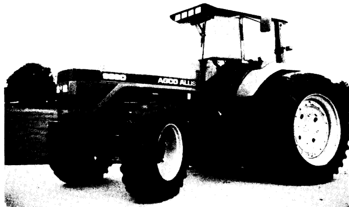
AGCO ALLIS 9690 DIESEL