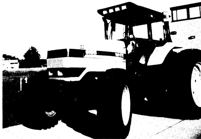
WHITE 6195 DIESEL