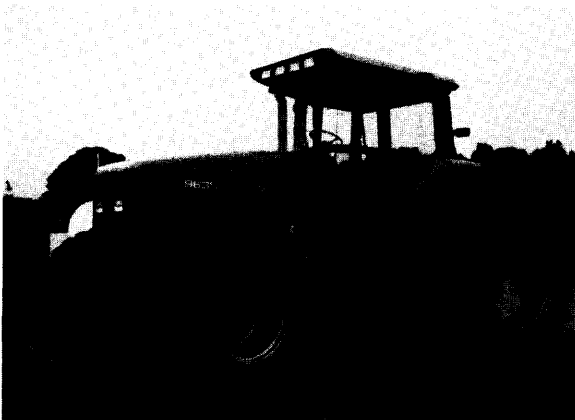
AGCO ALLIS 9635 DIESEL