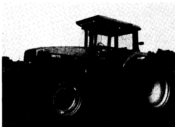
AGCO ALLIS 9675 DIESEL