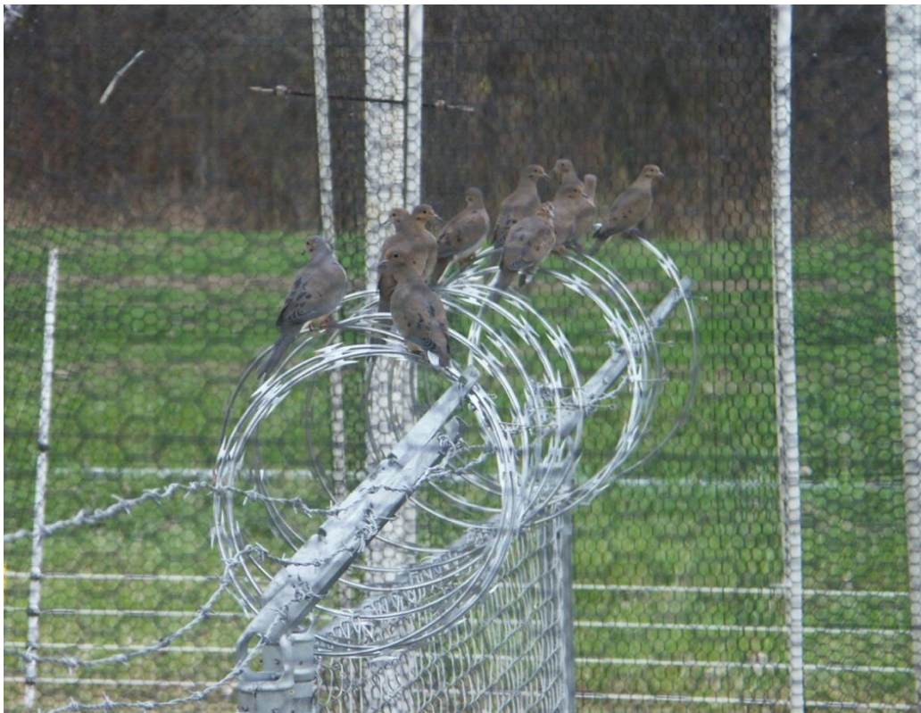
Figure 1. Mourning doves ( Zenaida macroura ) perched on the Razor-ribbon™ Helical razor-wire during the experimental period.

* During the pre-treatment period, the fences where the razor-wire was attached (for the post-treatment period) were controls.