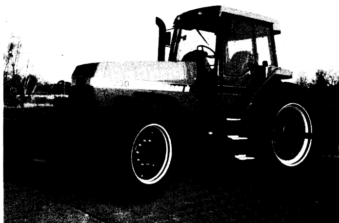
CASE IH 7230 DIESEL