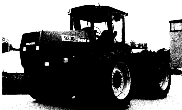
CASE IH 9330 Diesel