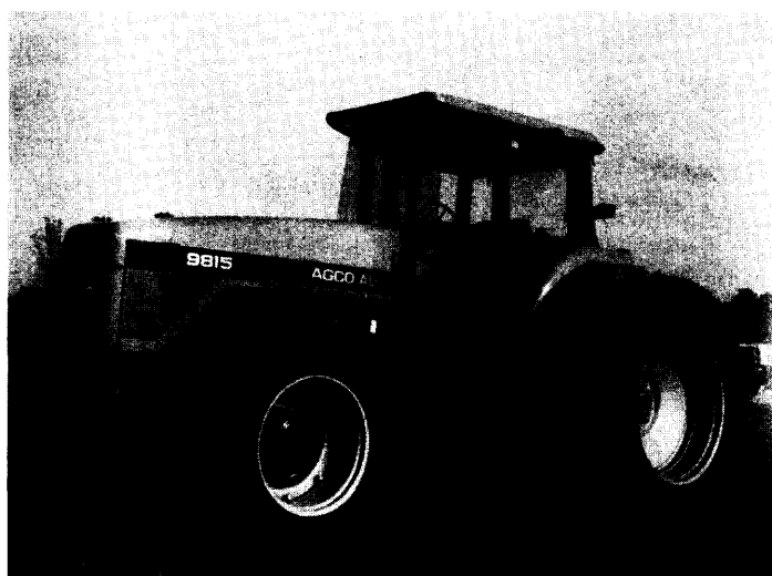
AGCO ALLIS 9815 DIESEL