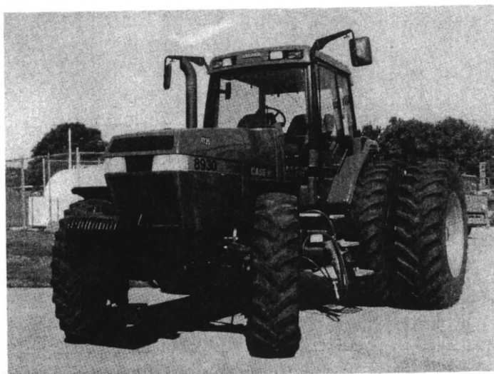
CASE IH 8930 DIESEL