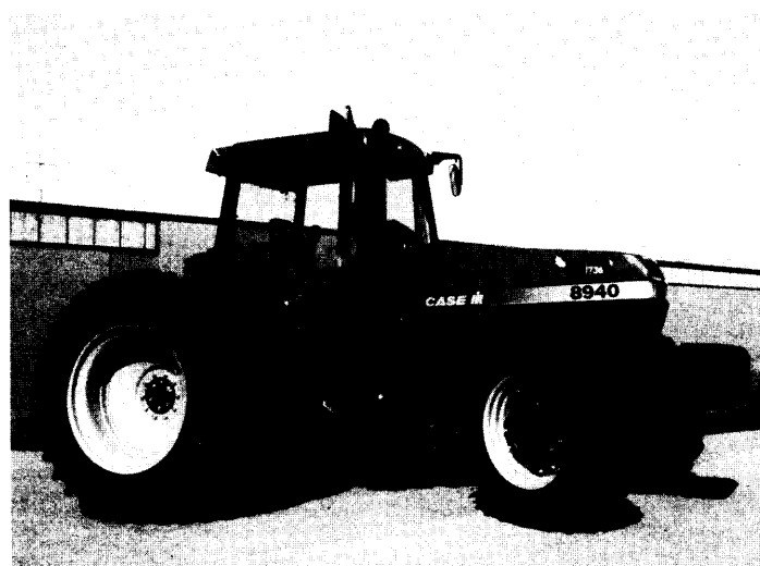
CASE IH 8940 DIESEL