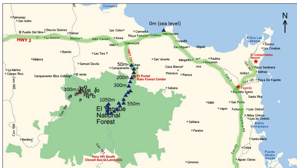
Figure 2. Map of northeastern Puerto Rico, with Caribbean National Forest (El Yunque National Forest) identified in green. Each blue triangle is a 50-m elevation increment and represents 3 tracking tunnels along the elevation gradient. The red triangle is El Verde Field Station, and the tracking tunnels that were placed in each habitat are clustered in that part of the forest (the Tabonuco Forest type). T = treefall gap ( n = 1 ), L = landslide ( n = 3 ), Y = 1.5-yr-old hurricane gap ( n = 3 ), O = 15-yr-old hurricane gap ( n = 3 ), S = stream edge ( n = 7 ), R = continuous forest near road ( n = 3 ), F = continuous forest interior ( n = 6 ); the single P represents a cluster of tracking tunnels ( n = 12 ) within the Palo Colorado Forest type, near Puerto Rican Parrot habitat. Map provided by the US Forest Service and modified; elevations and site locations estimated.

We established additional tracking tunnels ( n = 26 ) in Tabonuco Forest (300–485 m elevation) near El Verde Field Station (Fig. 2) on 4 June 2017 and checked their tracking after 1 day and 2 days. We placed these tunnels at different locations to determine invasive rodent presence in the major habitats in the CNF, including a treefall gap ( n = 1 ), landslides ( n = 3 ), 1.5-year-old hurricane gaps ( n = 3 ), 12-year-old hurricane gaps ( n = 3 ), stream edges ( n = 7 ), closed-canopy forest near a road ( n = 3 ), and closed-canopy interior forest ( n = 6 ). We also sampled the Palo Colorado Forest in closed-canopy forest (540–570 m elevation) by placing 12 tracking tunnels in Puerto Rican Parrot habitat (Fig. 2) on 10 June 2017 and recovering them after 1 day; 6 tunnels were placed on each side of the Espíritu Santo River and were not closer than 50 m to the river. Each tunnel was ~20–30 m distance to the next closest tunnel in Palo Colorado Forest and ~20–50 m to the next closest tunnel in Tabonuco Forest. The treefall gap was <2 years old and ~66 m 2 (6 m x 11 m), and the landslides were each <1 year old