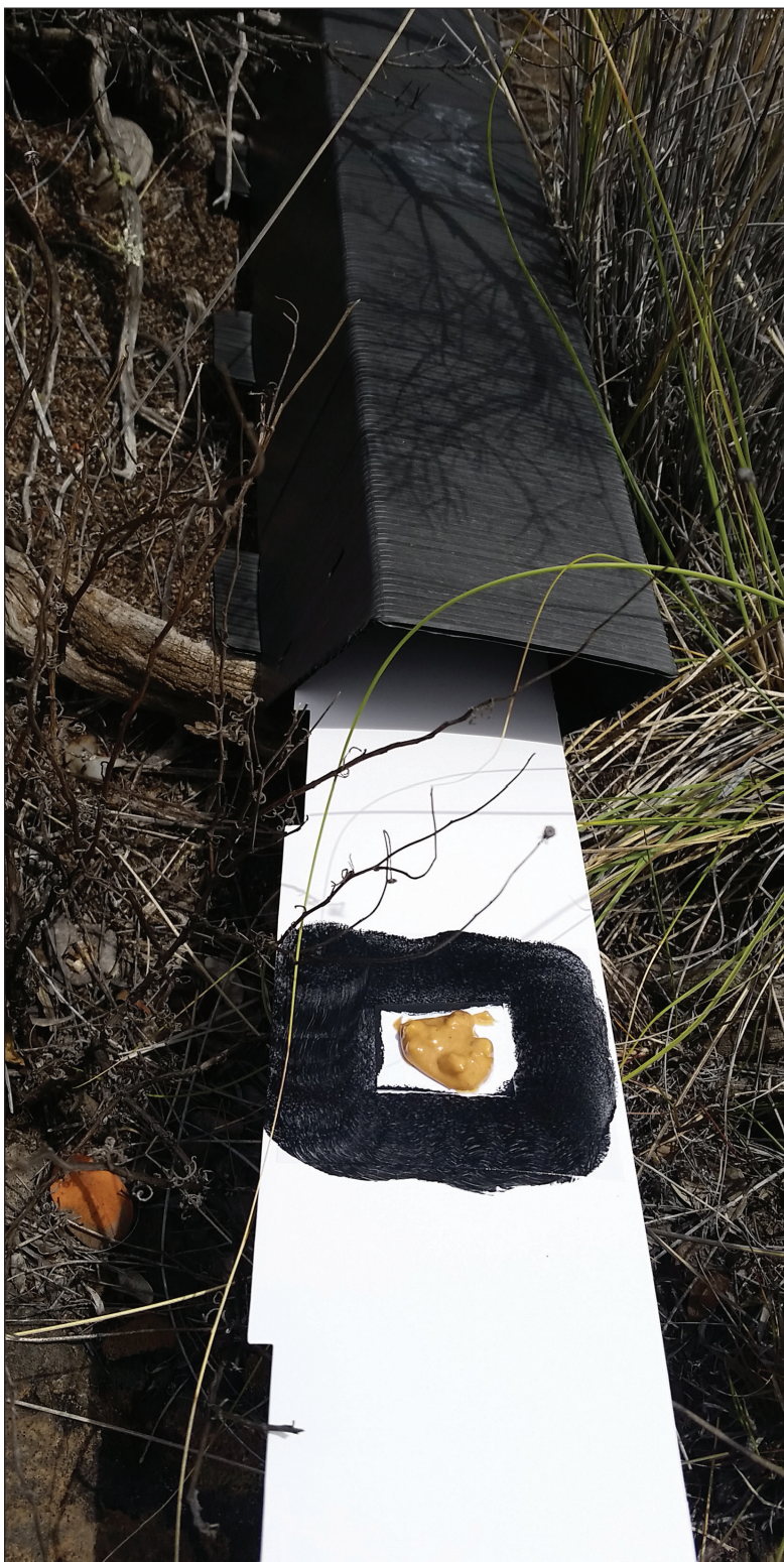
Figure 1. Picture of a tracking tunnel (rectangular black tube) with an inked tracking card baited with peanut butter and ready to be inserted into the tunnel.