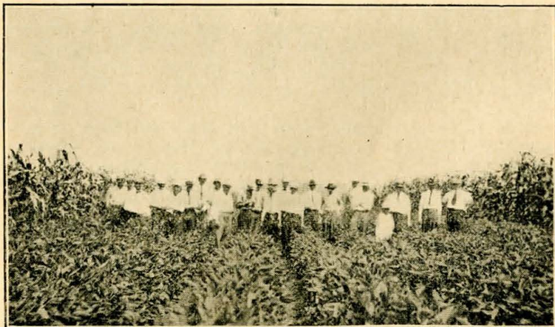
FIG. 3.—A group of Richardson county farmers investigating soybeans grown in blocks of several rows to be pastured off with the corn.

The soybeans should be in the dough stage with the leaves still retained when the animals are turned in. Some of the beans normally shatter but these, together with lost corn are picked up by the hogs after the field is pretty well pastured off. The majority of reports received from farmers indicate that the planting of beans in corn for hogging off is a good practice. This is particularly true when pastures of alfalfa and red clover are not available.