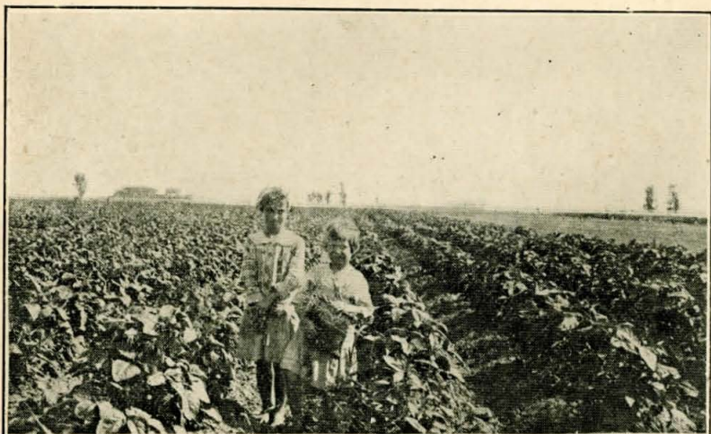
FIG. 2.—For the greatest yield of grain soybeans should be grown in rows and kept well cultivated to keep out the weeds.

Soybeans for Soil Building. Being a legume, soybeans are able to utilize the nitrogen of the air for at least part of their growth and have, in common with such crops as alfalfa and the clovers, a beneficial effect on the soil. Available data, however, indicate that the soybean crop leaves a smaller amount of nitrogen and organic matter in the soil than does