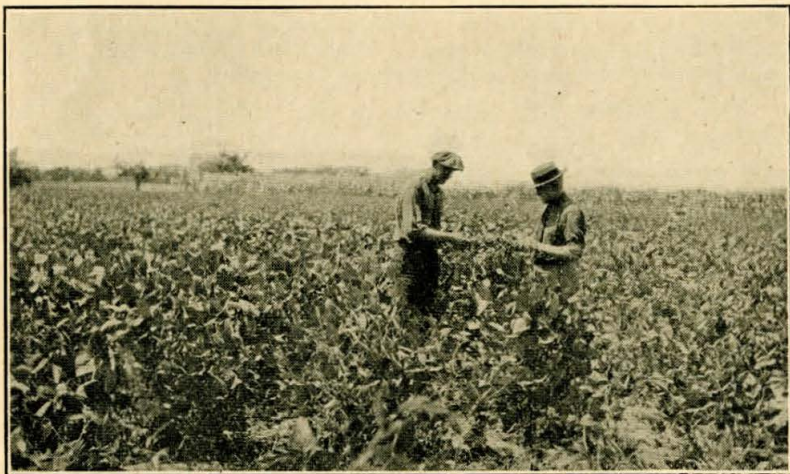
FIG. 1.—Soybeans grown in rows for grain.

Soybeans in Corn for Hogging Off. The chief object of growing soybeans with corn to be pastured off by hogs or