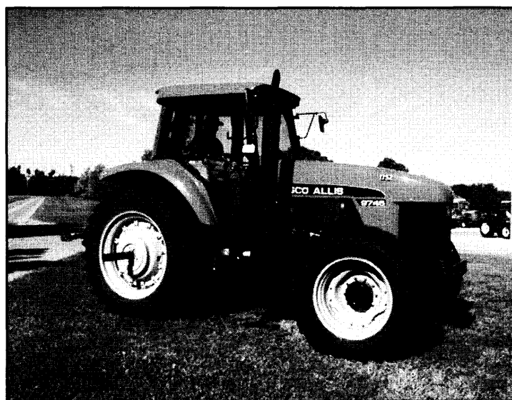
AGCO Allis 9745 Diesel