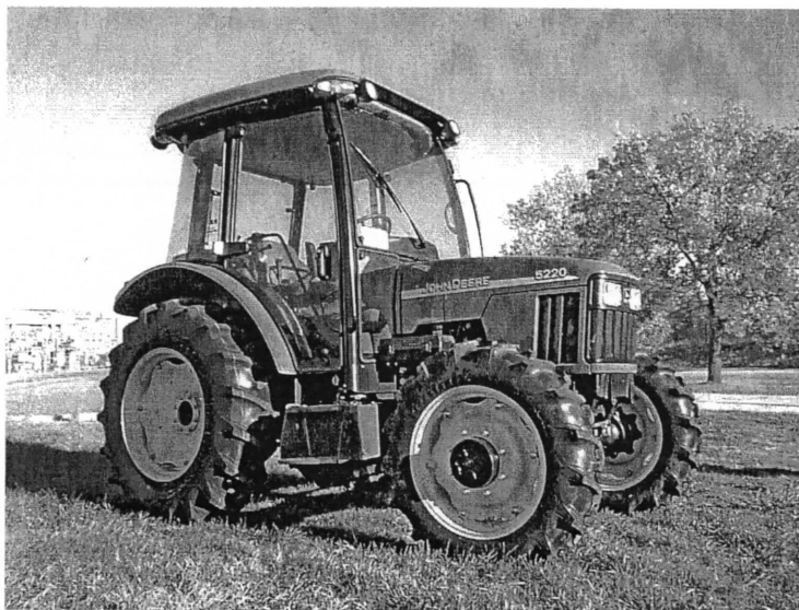
John Deere 5220 Diesel

Hitch point distance to ground level in. (mm) 8.0 (203) 15.0 (381) 22.0 (559) 29.0 (737) 36.0 (914) Lift force on frame lb 4694 4829 4685 4266 3596 " " " " " " (kN) (20.9) (21.5) (20.8) (19.0) (16.0)