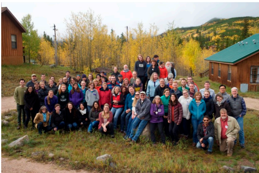
Figure 2. Attendees at the 2017 meeting of the Rocky Mountain Virology Association in the Mountain Campus of Colorado State University.