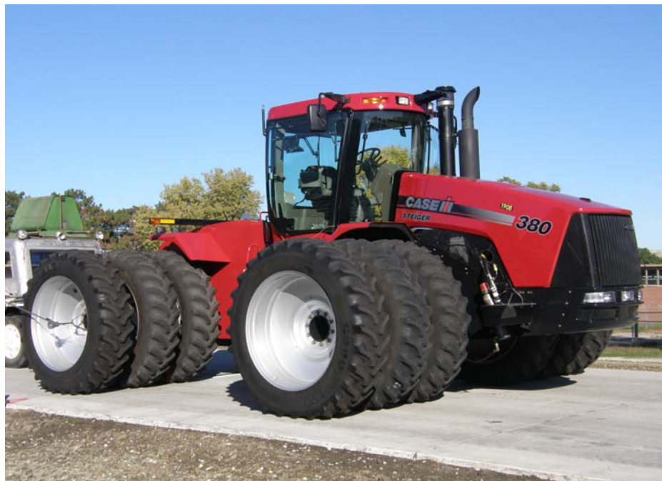
Case IH STEIGER 380 Diesel

Institute of Agriculture and Natural Resources University of Nebraska-Lincoln