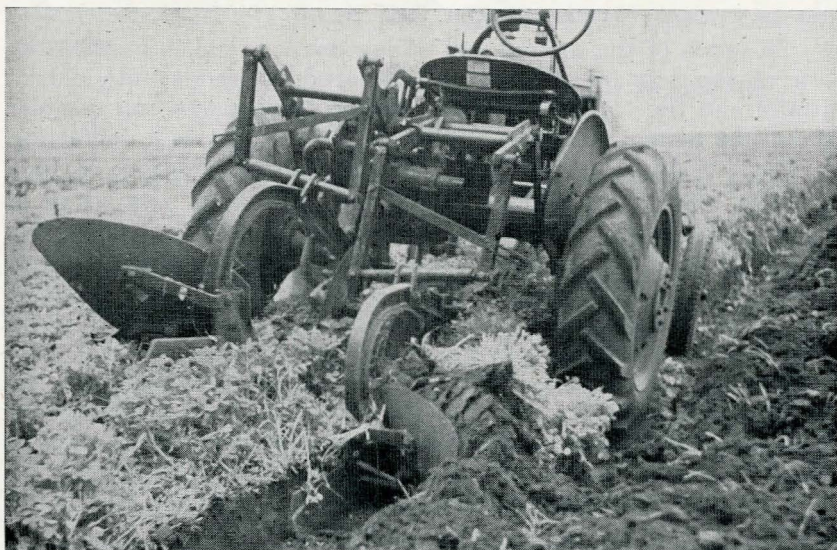
A heavy crop of biennial sweet clover which is permitted to make its full growth during the first year will place from 100 to 150 pounds of nitrogen per acre in the soil when plowed under in the spring of the second year after 12 to 18 inches growth is obtained.

The optimum time to plow under legumes is somewhat dependent upon the results desired. For example, young sweet