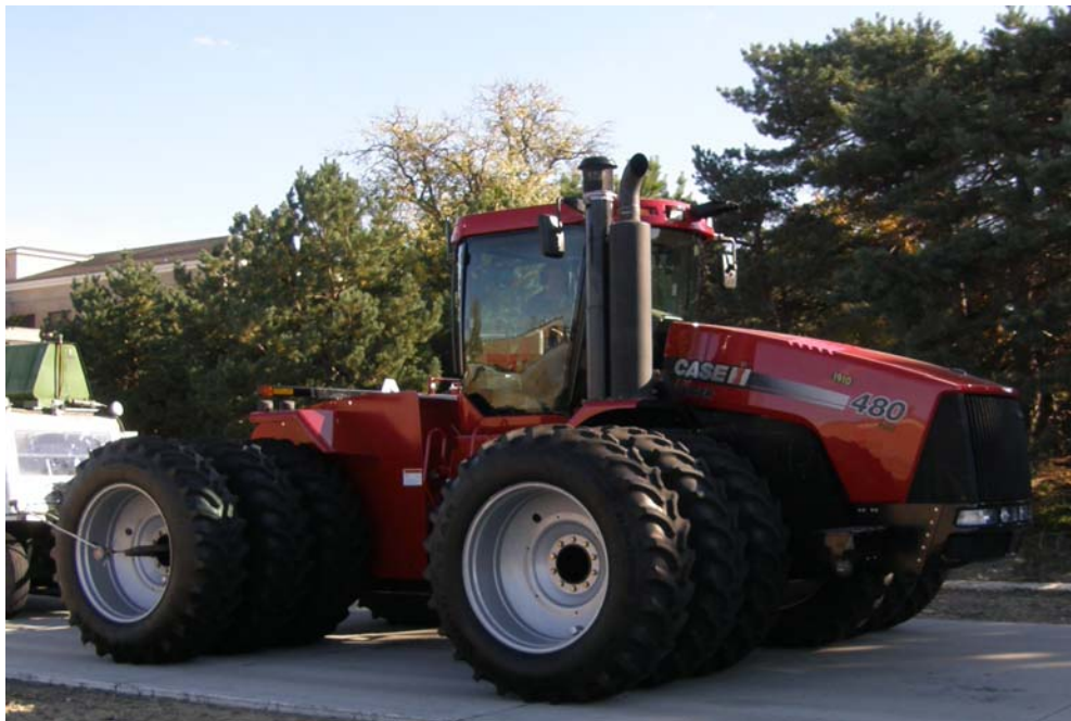
Case IH STEIGER 480 Diesel

Institute of Agriculture and Natural Resources University of Nebraska-Lincoln