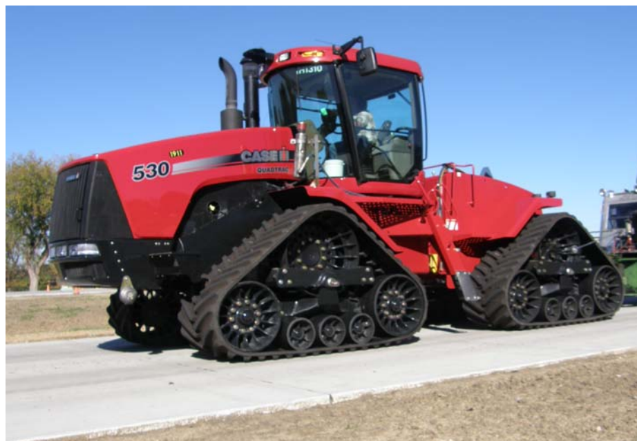
Case IH Steiger 530 Quadtrac Diesel