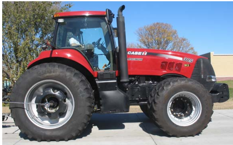
CASE IH MAGNUM 305 DIESEL