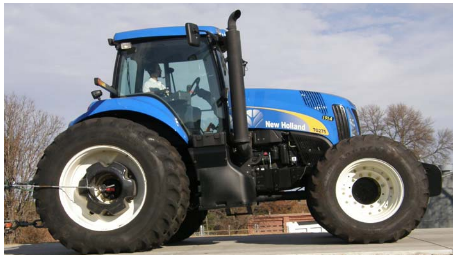
NEW HOLLAND TG275 DIESEL