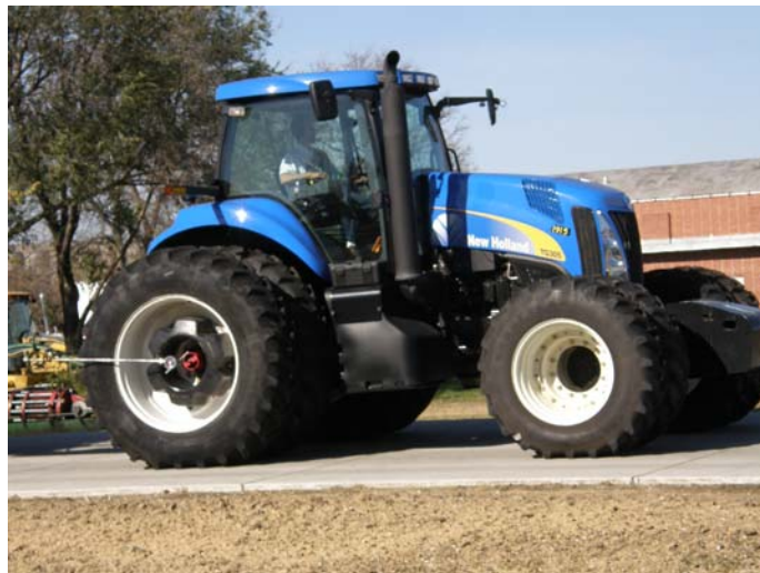
NEW HOLLAND TG305 DIESEL