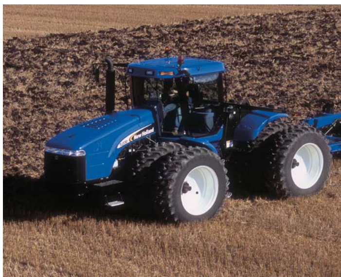
New Holland TJ 330 Diesel