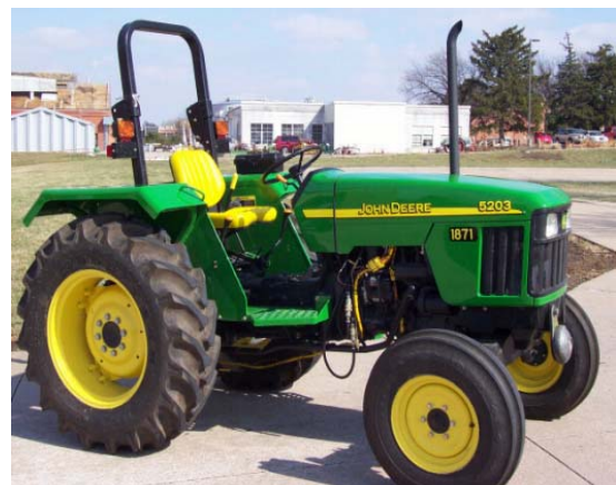
John Deere 5203 Diesel