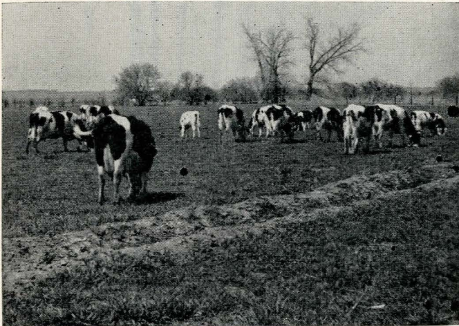
Good pastures give higher net returns than cultivated crops.

It was not long, however, until problems began to develop. First, it was discovered that some fields of brome-grass were doing well while others made an inferior growth, even on rich soil.