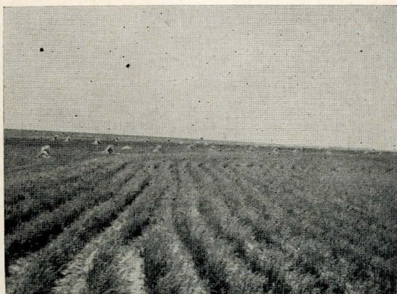
Producing bromegrass seed in contour rows.

Bromegrass seed production is usually a profitable enterprise. Returns per acre from the sale of seed often exceed those from grain and other cultivated crops, especially if certified seed is produced. Seed yields commonly range from 200 to more than 500 pounds per acre. Yields are influenced greatly by rainfall and the amount of available nitrogen in the soil. Nitrogen-starved bromegrass may yield little or no seed. Nitrogen applications up to 60 pounds of the element nitrogen per acre have given profitable returns in terms of increased seed yields.