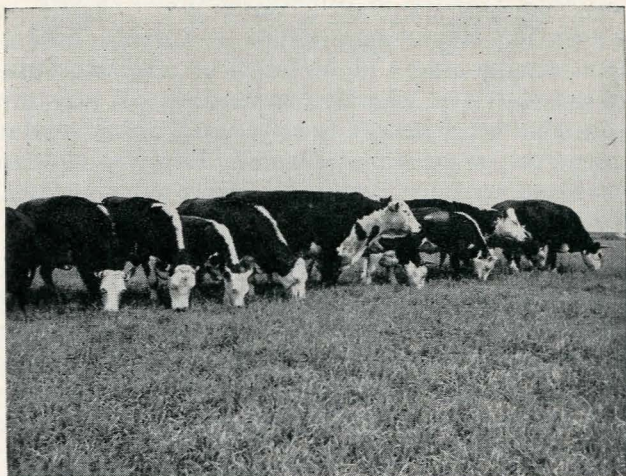
Bromegrass-alfalfa pasture can be expected to yield twice as much forage as bromegrass alone.

vide this nitrogen at almost no expense. Once established, a suitable legume will continue to provide nitrogen for an indefinite period if properly managed.