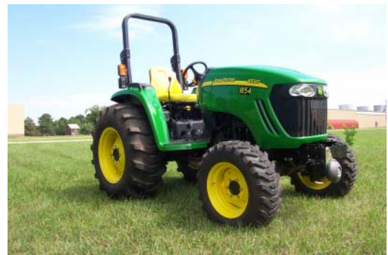
John Deere 4520 Diesel