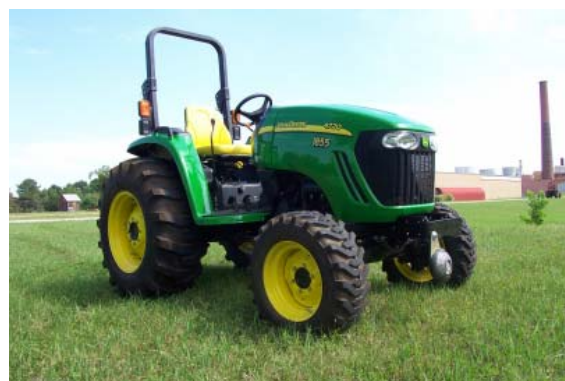
John Deere 4720 Diesel