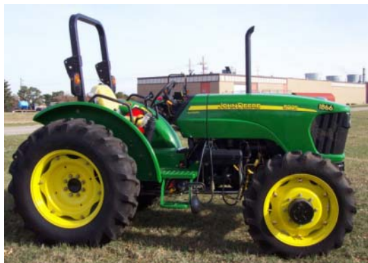
JOHN DEERE 5225 DIESEL

Institute of Agriculture and Natural Resources University of Nebraska-Lincoln