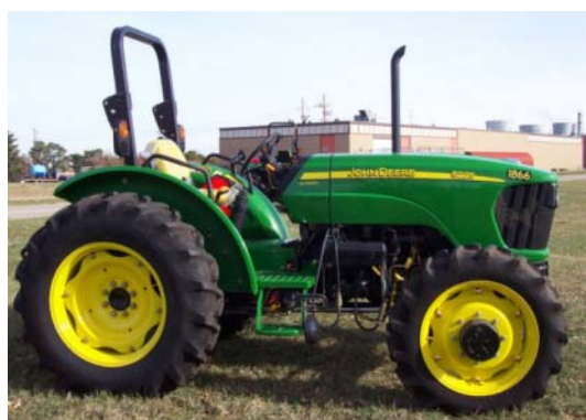
JOHN DEERE 5225 DIESEL

Institute of Agriculture and Natural Resources University of Nebraska-Lincoln