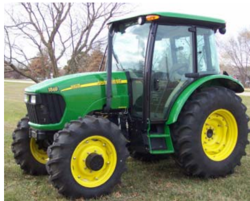
JOHN DEERE 5525 DIESEL