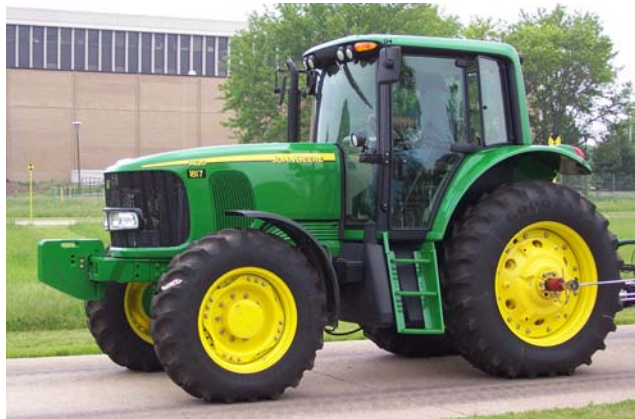
JOHN DEERE 7420 DIESEL