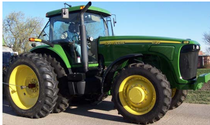
JOHN DEERE 8120 DIESEL